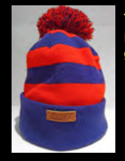
The Beast from the East! It's on the way!.. be prepared... get yourself a bobble hat £15