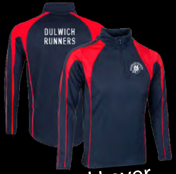
Pro Mid Layer 1-4 Zip Top