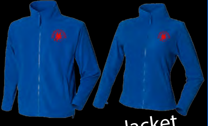
Micro Fleece Jacket