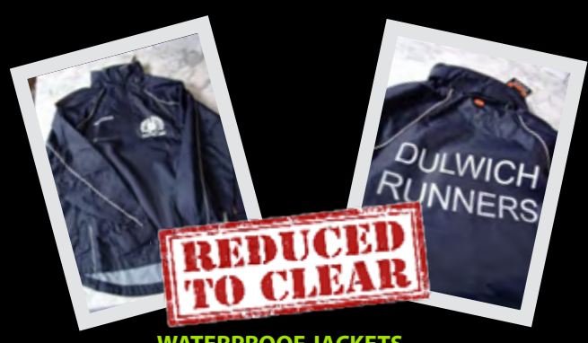
WATERPROOF JACKETS LIMITED STOCK - only £10 each Only 2 Xlarge left