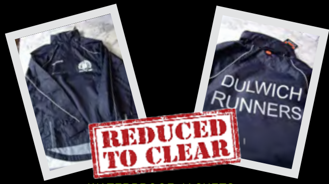
WATERPROOF JACKETS LIMITED STOCK - only £10 each Only 2 Xlarge left