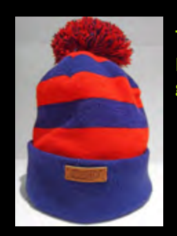
The Beast from the East ! It's always on the way!.. be prepared.. get yourself a bobble hat £15