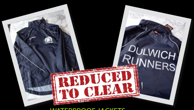
WATERPROOF JACKETS LIMITED STOCK - only £10 each Only 2 Xlarge left