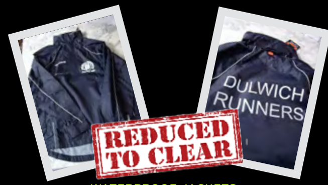
WATERPROOF JACKETS LIMITED STOCK - only £10 each Only 2 Xlarge left