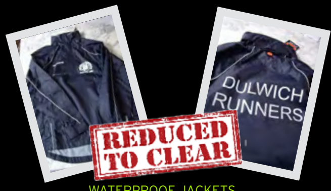
WATERPROOF JACKETS LIMITED STOCK - only £10 each Only 2 Xlarge left