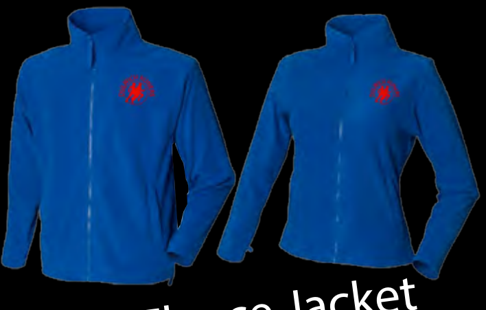
Micro Fleece Jacket