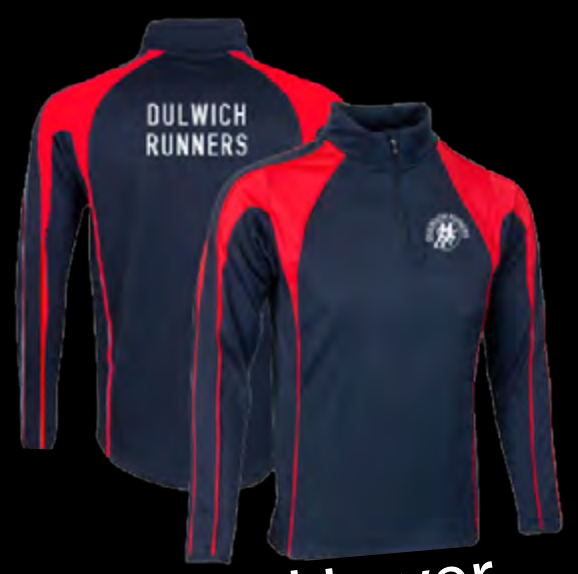
Pro Mid Layer 1-4 Zip Top