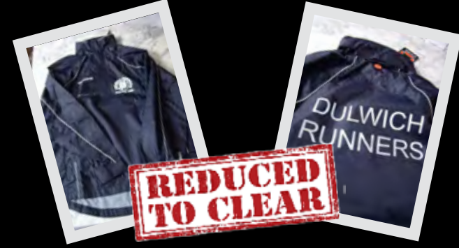
WATERPROOF JACKETS LIMITED STOCK - only £10 each Only 2 Xlarge left