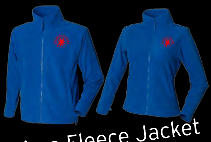
Micro Fleece Jacket