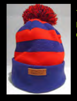
The Beast from the East! It's on the way!.. be prepared... get yourself a bobble hat £15