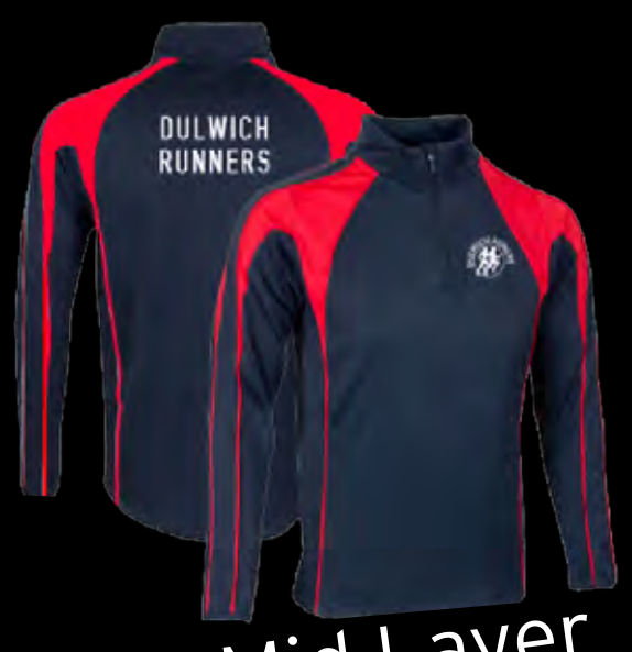
Pro Mid Layer 1-4 Zip Top