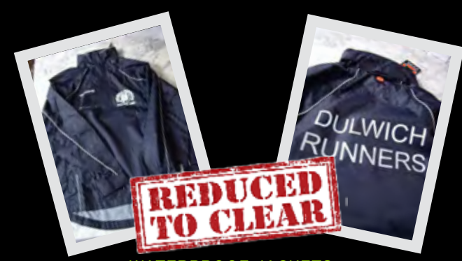
WATERPROOF JACKETS LIMITED STOCK - only £10 each Only 2 Xlarge left