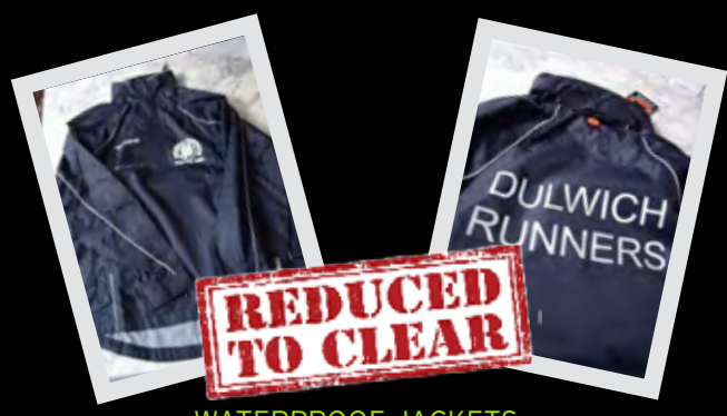
WATERPROOF JACKETS LIMITED STOCK - only £10 each Only 2 Xlarge left