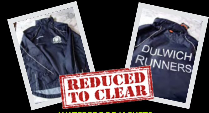
WATERPROOF JACKETS LIMITED STOCK - only £10 each Only 2 Xlarge left