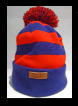
The Beast from the East! It's always on the way!.. be prepared.. get yourself a bobble hat £15