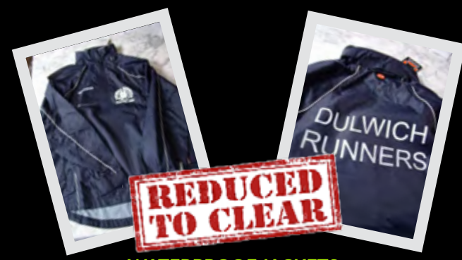
WATERPROOF JACKETS LIMITED STOCK - only £10 each Only 2 Xlarge left