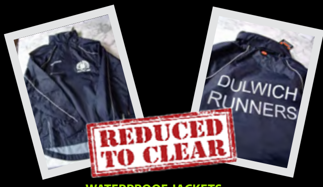
WATERPROOF JACKETS LIMITED STOCK - only £10 each Only 2 Xlarge left