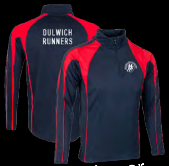
Pro Mid Layer 1-4 Zip Top