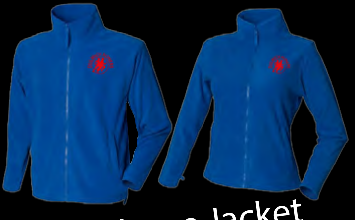
Micro Fleece Jacket