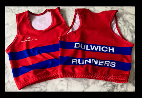
Crop tops - £25