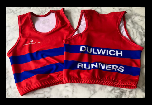
Crop tops - £25