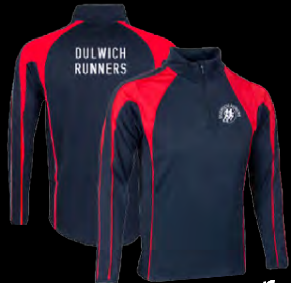
Pro Mid Layer 1-4 Zip Top