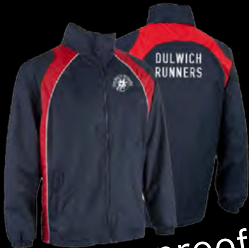
Showerproof Team Jacket