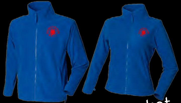
Micro Fleece Jacket